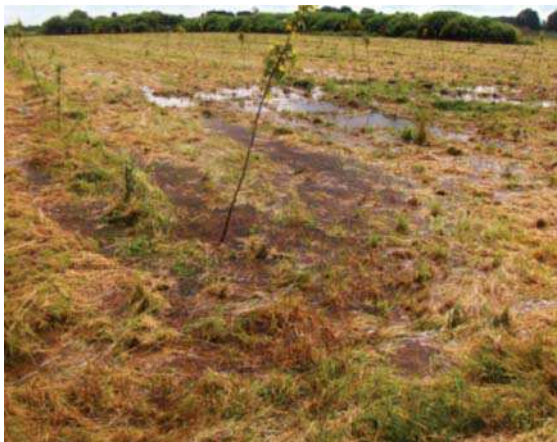
FIG. 3. The cultivation of apple trees, wetlands, on neighbouring meadows. No fence. Trees destroyed by animals