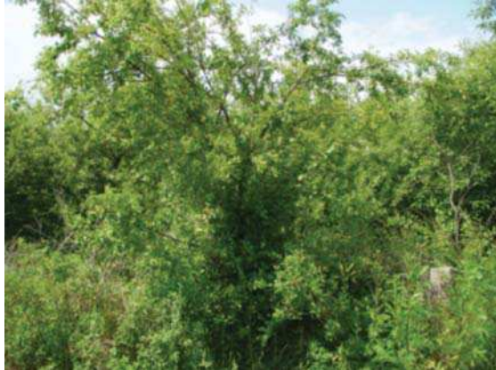
FIG. 2. 30-year-old multi-strain apple orchard, weeds preventing movement, protective cuts not made for a long time

actually organic. SAO estimated that fruit was sold as organic by only 3–5% of the areas inspected. Most growers (13) declared that when the RDP 2007–2013 came to a close, organics would be liquidated. This was because a large part of the controlled cultivation was established in areas that were thoroughly unsuitable for this purpose (the soil was too dry or wet), and the minimum agricultural measures had not been taken (fencing, protection against animals, elimination of weeds). Examples of such crops are depicted in Figures 2 and 3.